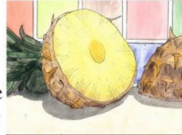
The pineapple is a symbol of hospitality

Hospitality is the ancient and primary vocation of religious community. The impulse to authentic hospitality emerges from an abiding sense of home and the reality that we are a stranger. When we welcome the stranger we are welcoming our self. Commitment to hospitality involves a concern for the stranger, the immigrant, the refugee, the homeless, the oppressed, those mired in poverty, and more.